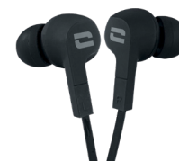
IPX4 WATERPROOF HEADPHONES