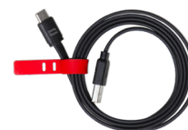
TYPE A/TYPE C USB CABLE